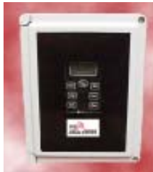
Model 202 IR