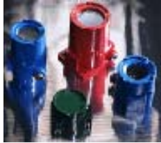
Model 900 Transmitters