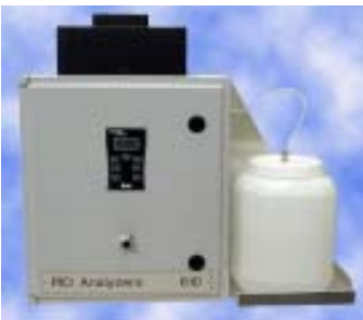
Model 610 Water Quality Analyzer