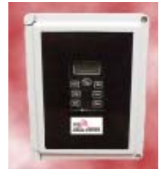
Model 1000 Toxic Gases