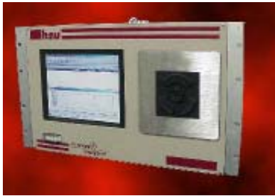
Model 301C 19" Rackmount PID