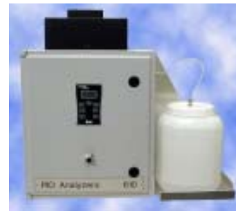
Model 610 Water Quality Analyzer