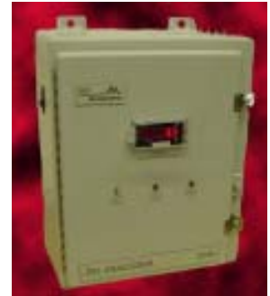
Model 201B Wallmount PID