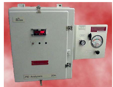
Model 204 TCD