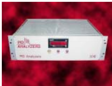
Model 210 19" Rackmount O 2