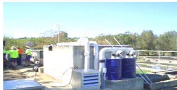
55 Gallon canisters of Carbon

PID Analyzers, LLC 2 Washington Circle Sandwich, MA 20563 T: 1 774 413 5281 em: sales@hnu.com url: www.hnu.com