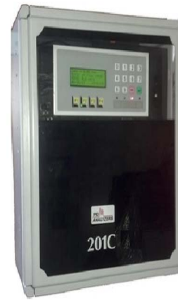
Model 201C Wall Mount